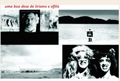
Cenas do CES III