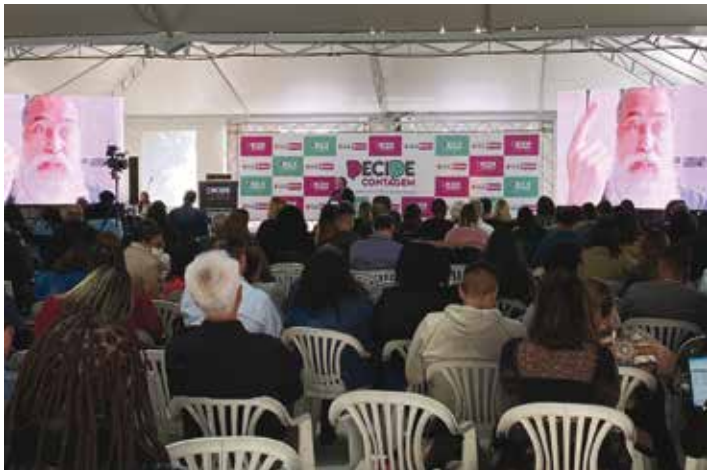
PHOENIX is invited at the Conference "Decide Contagem" in Contagem, Brazil (19 may, 2022)

creation of circuits of circular economy. The desk-research effort will help to create a portfolio of sound methodologies and tools to be combined with a diverse range of socio-cultural and environmental contexts of each territory to Enrich Democratic Innovations (EDIs) by testing its capability to augment their quality of deliberation and the capacity to foster the readiness to change and the commitment of different actors. The EDIs will be tailored and tested in 11 pilots from 7 countries at different administrative levels (local, regional, national, and transnational) - Italy, France, Portugal, Hungary, Estonia, and Iceland - while a transnational and bilingual pilot will take place in the Malcata mountains' area between Portugal and Spain. The last is designed to align PHOENIX goals with those of the European Mission "Adaptation to Climate Change", which is intended to support at least 150 European regions and communities towards climate resilience by 2030.