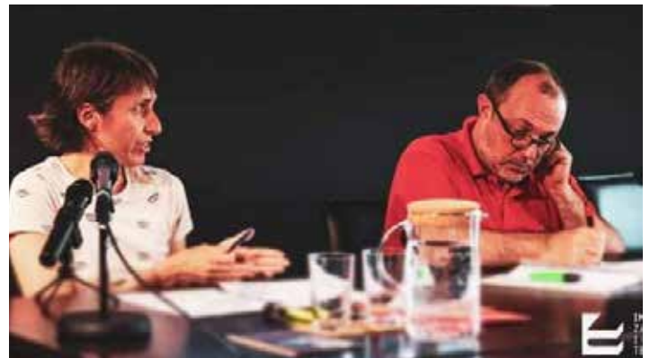
PHOENIX is invited at the Conference “Revitalising democracy” (Belgrade, May 16-18, 2022)

rich, consolidated tradition of participatory processes and deliberative methodologies successfully experimented in different policy-making domains, considering that they are necessary tools , but not sufficient ones , when it comes to facing the ambitious goals related to ecological transition patterns. Therefore, while the call that inspired PHOENIX was centred on the need of involving stakeholders mainly for the sake of an adequate implementation of measures that, often, were defined top-down, the project has a broader ambition of contributing to shape hybrid methodologies and tools that can help to co-design with citizens the next phases of the European Green Deal framework itself.