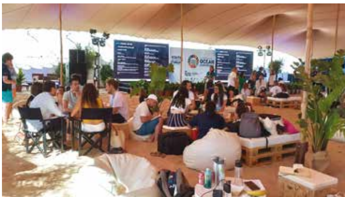
PHOENIX is an external observer to the UN CONFERENCE ON Oceans (Lisbon: June 26-July 1, 2022) and at the Youth Forum on OCEANS held in Carcavelos

creation of circuits of circular economy. The desk-research effort will help to create a portfolio of sound methodologies and tools to be combined with a diverse range of socio-cultural and environmental contexts of each territory to Enrich Democratic Innovations (EDIs) by testing its capability to augment their quality of deliberation and the capacity to foster the readiness to change and the commitment of different actors. The EDIs will be tailored and tested in 11 pilots from 7 countries at different administrative levels (local, regional, national, and transnational) - Italy, France, Portugal, Hungary, Estonia, and Iceland - while a transnational and bilingual pilot will take place in the Malcata mountains' area between Portugal and Spain. The last is designed to align PHOENIX goals with those of the European Mission "Adaptation to Climate Change", which is intended to support at least 150 European regions and communities towards climate resilience by 2030.