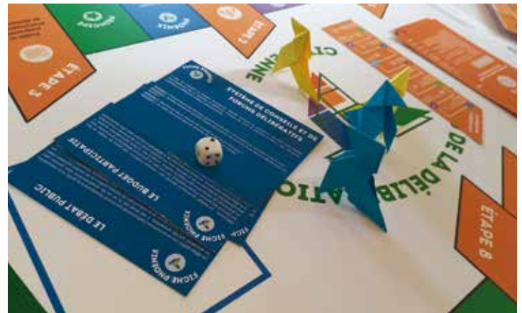
PHOENIX (through its French partner "Res Publica" has a stand and organizes an event during the High-Level Conference on civic engagement in European Missions organized under the French Presidency of the EU (Paris, 21 March, 2022)

help to maximize the commitment of citizens to a climate-neutral society. The project will also test tools based on Information and Communication Technologies (ICT) and Artificial Intelligence (AI), that can favour exchanges with multilingual and multicultural facets grounded on evidence-based results. The latter will be an important component for complying with the final goals of PHOENIX, of supporting the mainstreaming, scalability and adaptability of the tested and assessed methodologies and leveraging a series of collectively-built Policy Recommendations.