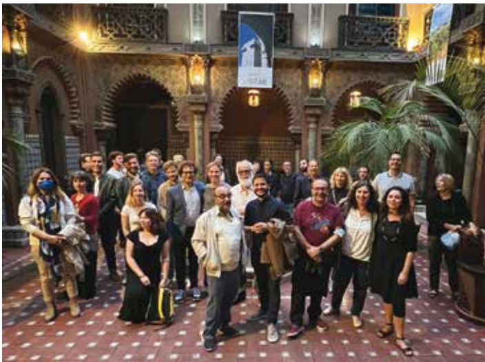
PHOENIX International Team

The European Green Deal (EGD) transition pathway is a major challenge for Europe to ensure the transition towards a climate-neutral society. All 27 EU Member States pledged to reduce emissions by at least 55 % by 2030, however, these targets were elevated following the pandemic outbreak. The importance of this achievement has been stimulated by the war in Ukraine raising a discussion about how such targets could be radicalized to contribute to a greater independence of Europe from foreign countries in energy matters. The EGD ambitions require joint efforts to harmonise diverse contexts and visions of human/other-than-human relations. If citizens’ engagement, as envisioned in the “European Democracy Action Plan” (EDAP, 2020) is seen as a central pre-condition for institutional policies and projects’ success, this is because behavioural changes and transformations in large populations’ lifestyles and expectations are vital for the EGD’s implementation and for an approach inspired by just transition goals.