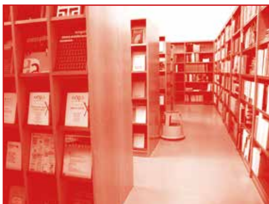
BN|S Registered Users