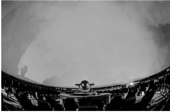
Figure 3. The new Rio Tinto Alcan Planetarium. The technical wizardry employed in the Astronomical Theatre will make it possible to present the clearest starry sky in Montréal.