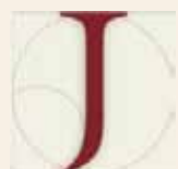
Observatório Permanente da Justiça Portuguesa