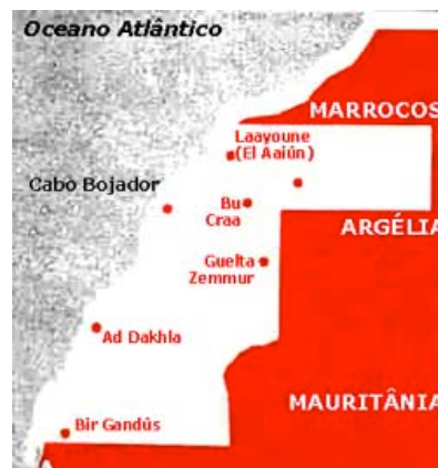
Western Sahara map

The Western Sahara has been called the 'last colony in Africa' (Toby, 2004). Precisely, the actions of the United Nations were always taken from the view that the situation in Western Sahara is a case of decolonisation. Consequently, the future of Western Sahara should be resolved by the exercise of the right to self-determination through a referendum held by the United Nations with two options: integration into Morocco or independence. However, in this case, the United Nations has failed to put its doctrine into practice and to organise a referendum. Moreover, this inability of the United Nations has been fuelled by its own dubious attitude when encouraging the parties (Morocco, Polisario Front and Algeria) to negotiate (CG, 2007).