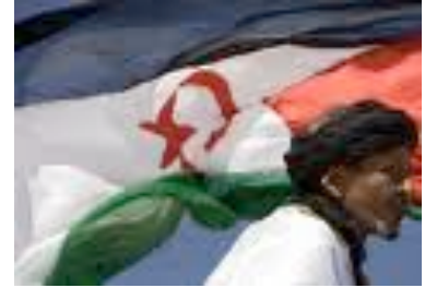
Western Sahara flag

The Court, after stating its opinion on how the Western Sahara at the time of Spanish colonisation was not terra nullius , concluded that there was no sovereign connection between the territory of Western Sahara and Morocco or Mauritania. The Declaration on the Granting of Independence to Colonial Countries and Peoples would apply to the decolonisation of Western Sahara. It was thus recognised the Sahrawi people's right to self-determination. Under that Declaration "immediate actions should be taken in trust territories and non-autonomous territories or other areas that still are not independent, to transfer all powers to the peoples of those territories, without condition or reservation, according to its will and desire freely